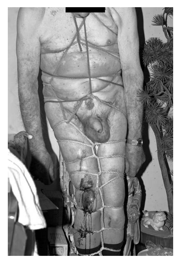
Fig. 1 Scene photograph illustrating the ropes bondage system

increase or release pressure by moving his head up and down.